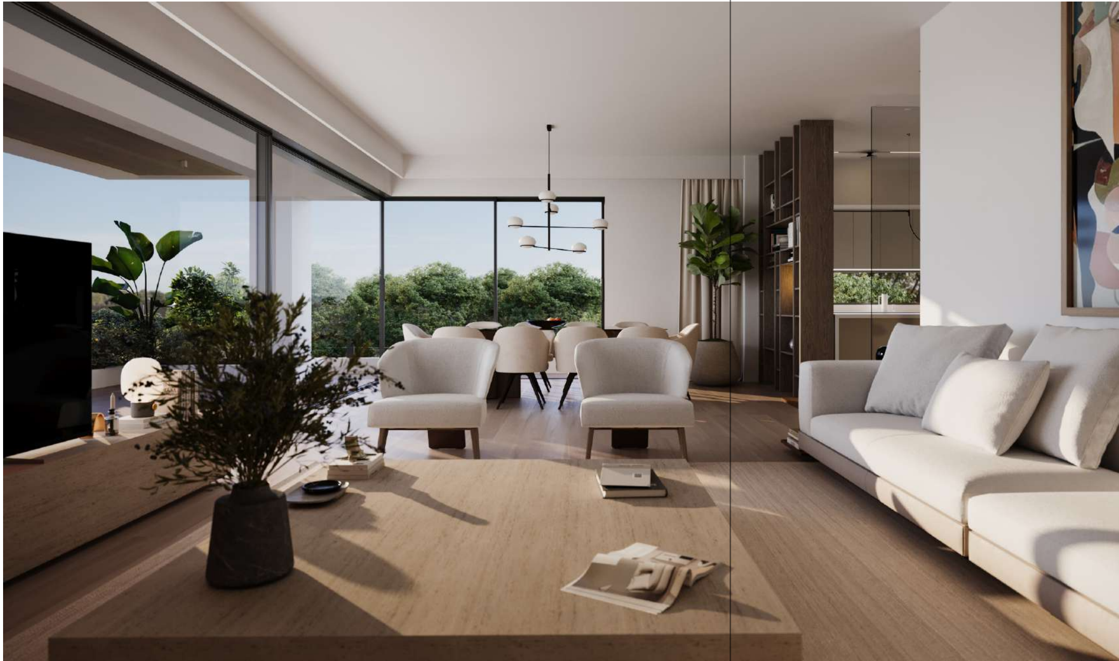
RESIDENCE C1 — living area views —