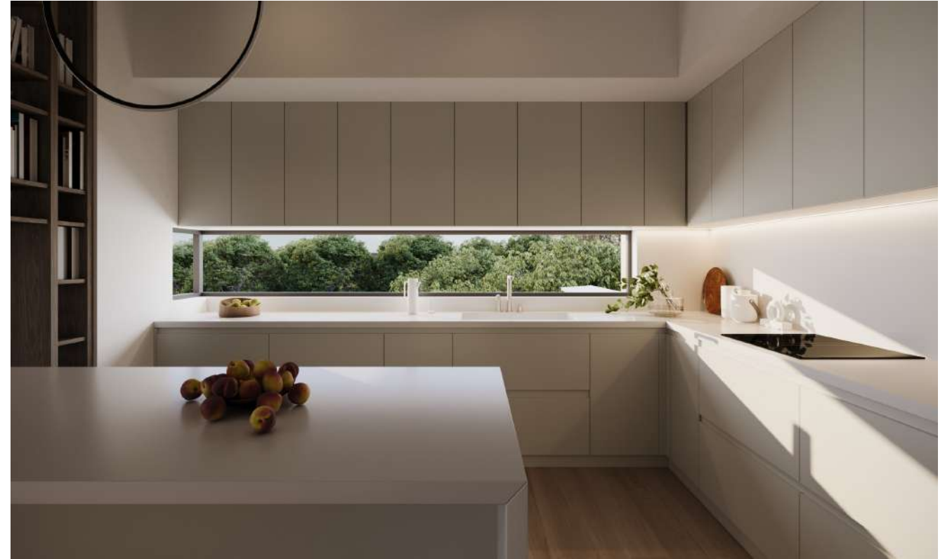
RESIDENCE C1 — kitchen area views —