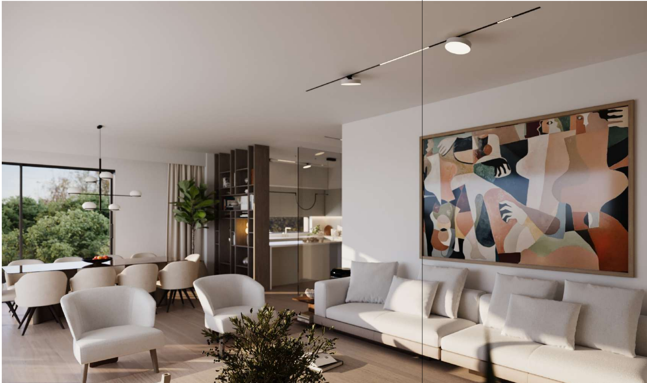
RESIDENCE C1 — living area views —