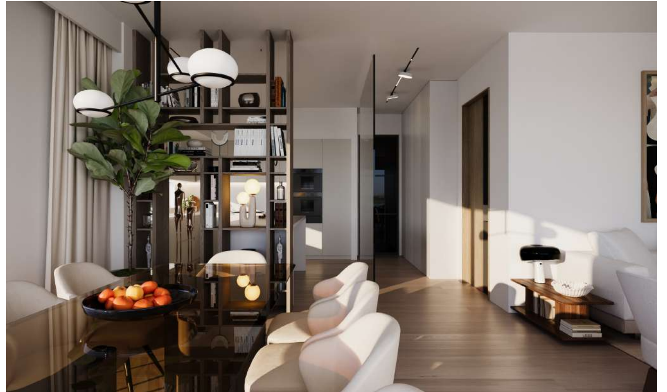
RESIDENCE C1 —— living area views ——