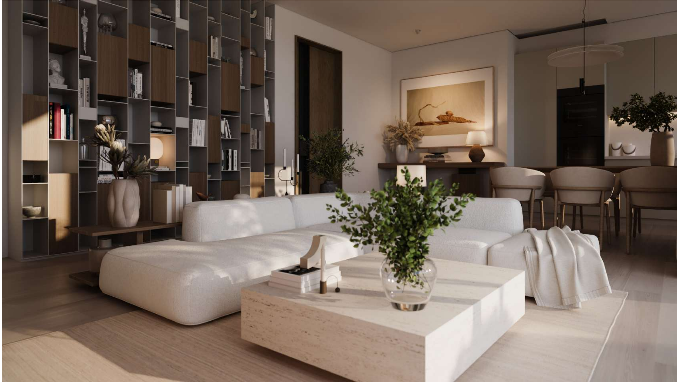
RESIDENCE B1 living views