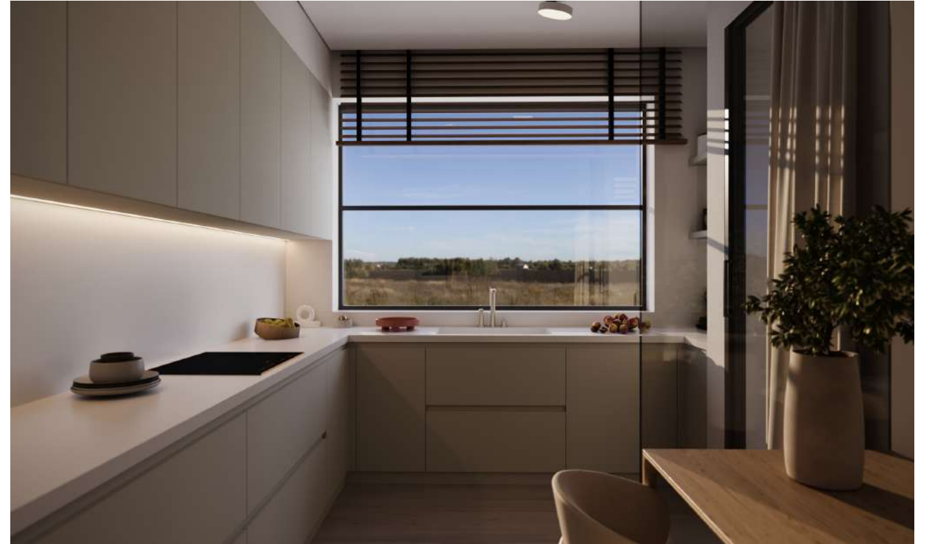
RESIDENCE B1 kitchen views