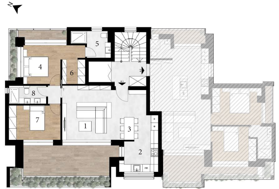
level 2 0 1 2 3 4