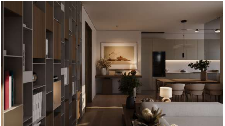
RESIDENCE B1 living area views